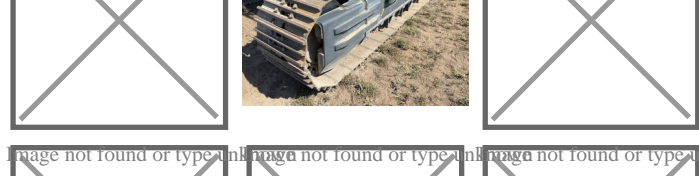
Image not found or type unknown